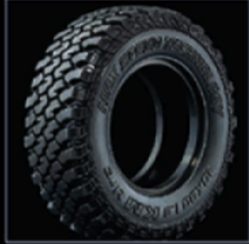
KM Crawler tire 30X90-1.9" (medium-40") (2) KM 攀岩胎 30X90-1.9" (中-40") (2)